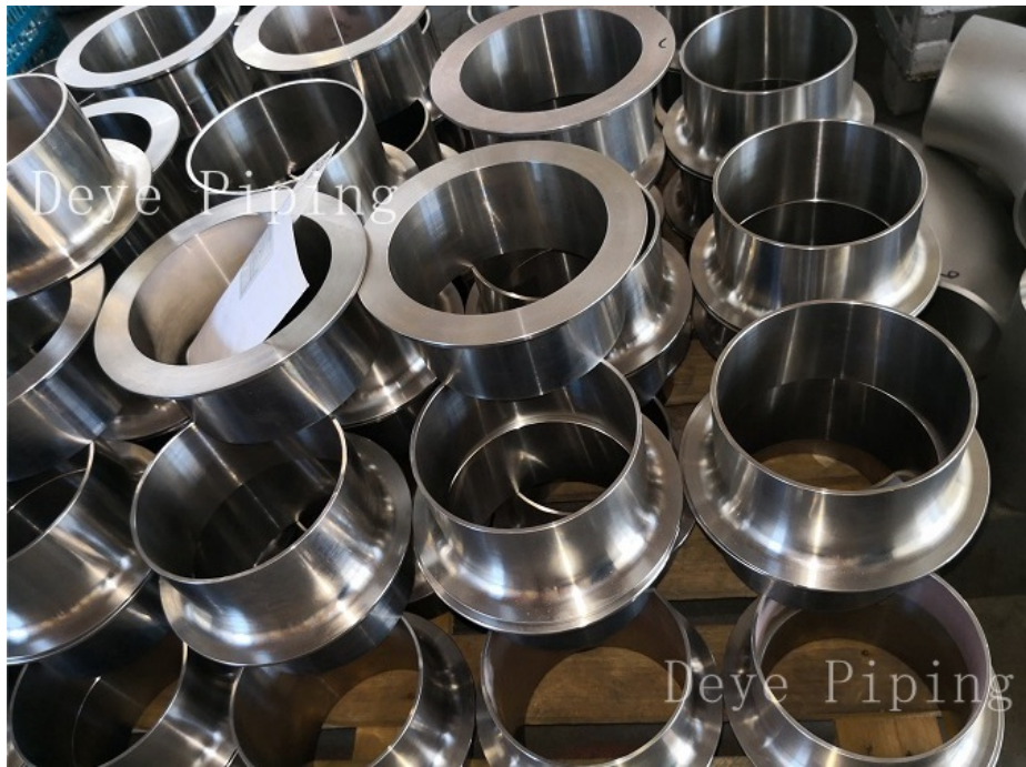
9. stainless steel Pipefittings Material In Stock