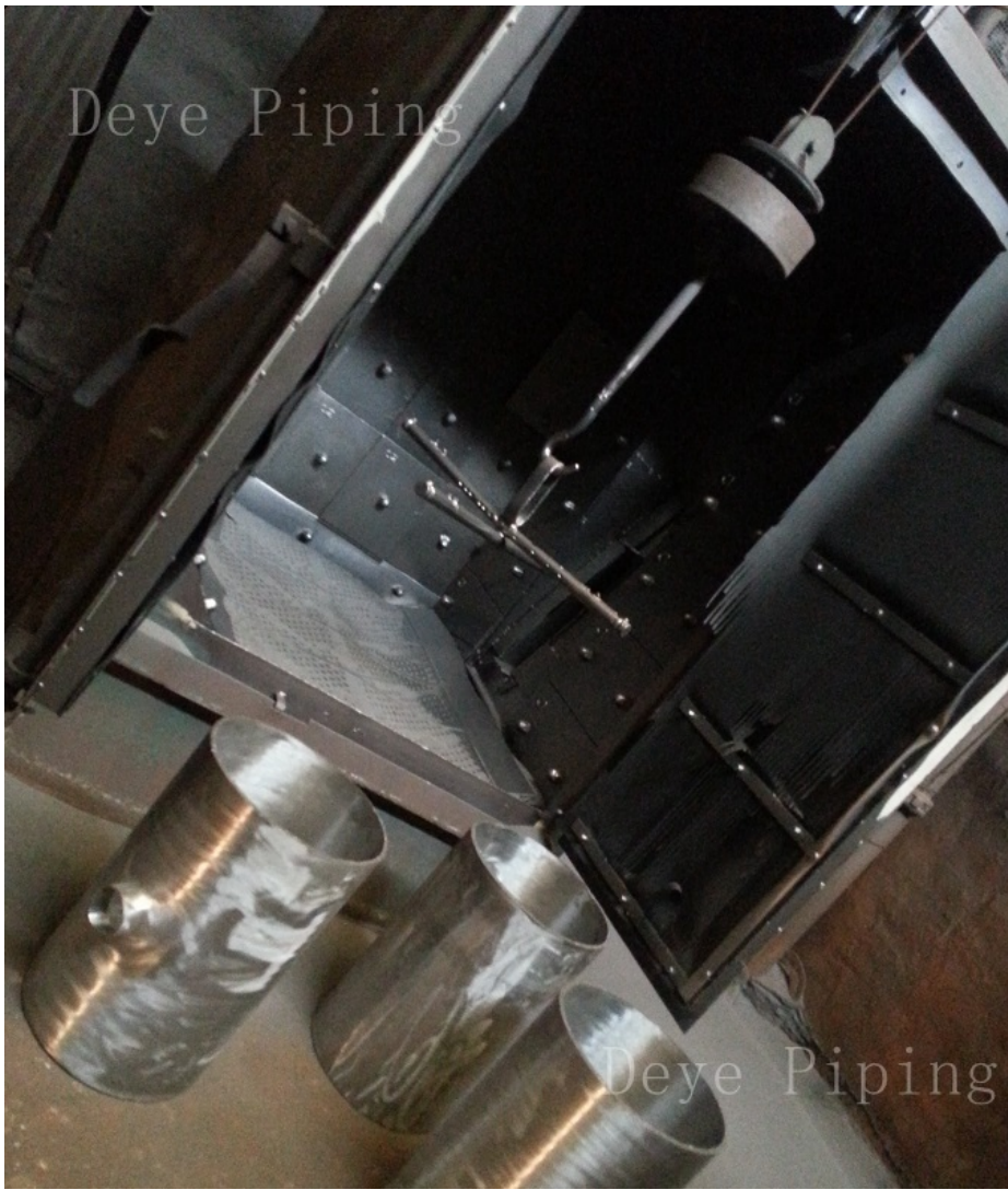
7. Surface checking