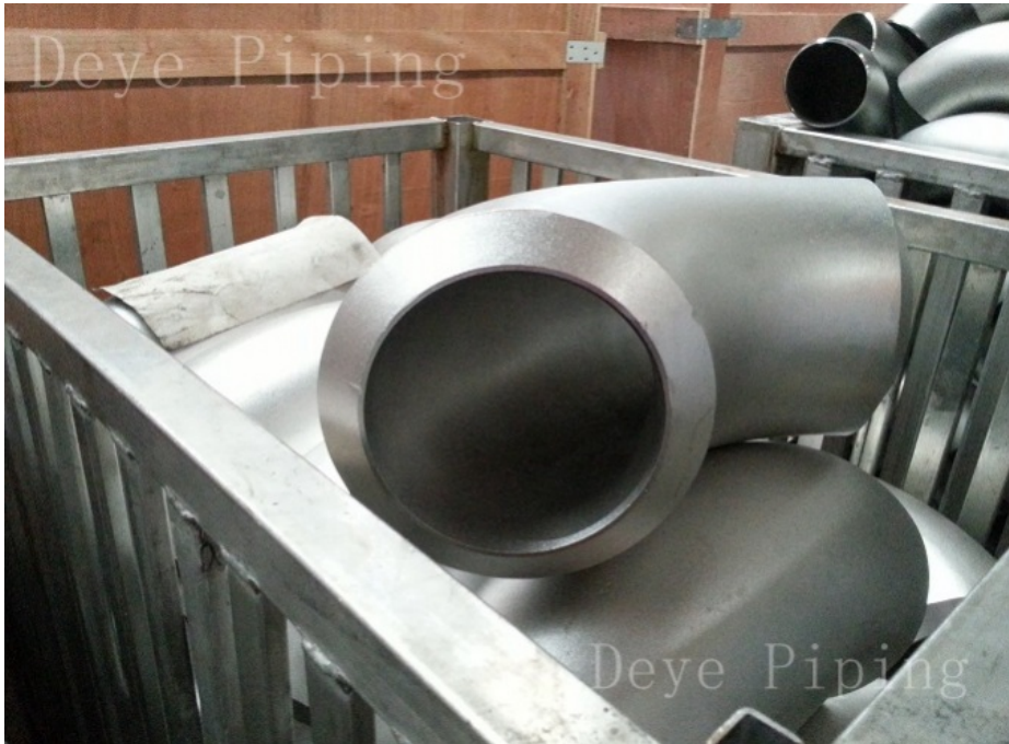
8. After Polished