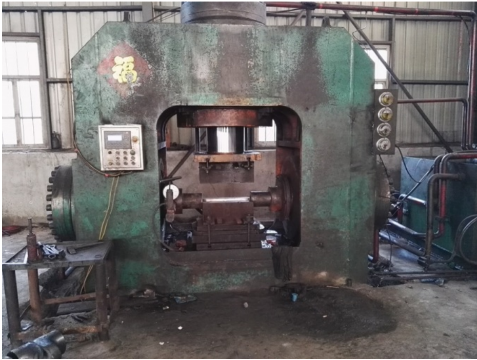
Reducer Form process and equipment