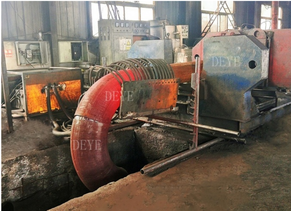
ELBOW Shaper Machining