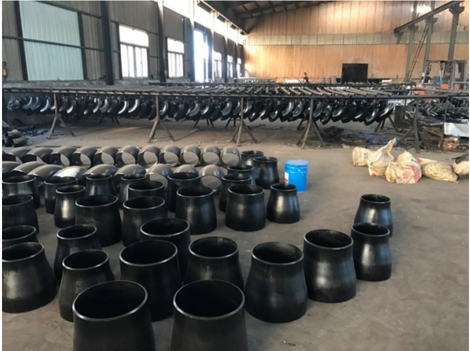
Package For shipment