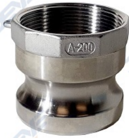
316 SS Camlock quick coupling Male camlock adaptor inner thread