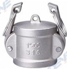
316 INOX Camlock Dustplug