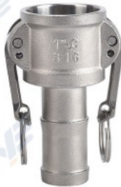
316 SS Camlock hose tail coupling Female camlock coupler with serrated hose tail