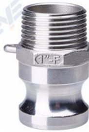
316 SS Camlock hose tail coupling Male camlock adaptor hose connection