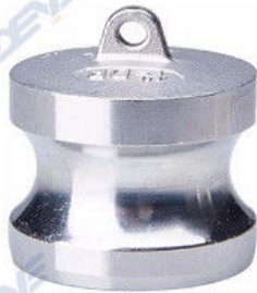
316 INOX Camlock Dustplug