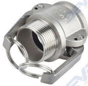
316 SS Camlock coupler Female camlock coupler outer thread