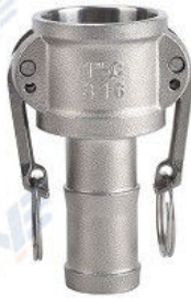
316 SS Camlock hose tail coupling Female camlock coupler with serrated hose tail