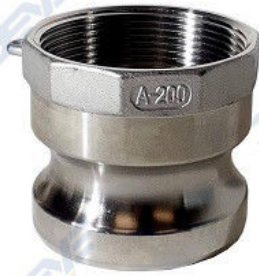
316 SS Camlock quick coupling Male camlock adaptor inner thread