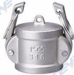
316 INOX Camlock Dust cap