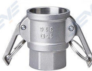
316 SS Camlock lever coupling Female snaplock coupler inner thread