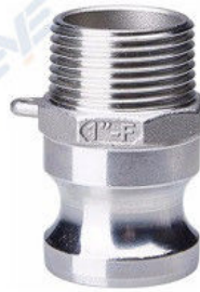
316 SS Camlock quick coupling Male camlock adaptor outer thread